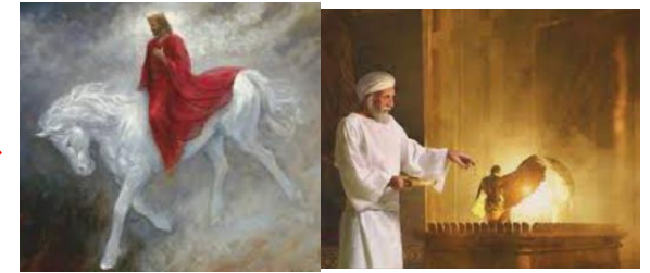
1 Thessalonians 4:16-18

For the Lord Himself will descend from heaven with a shout, with the voice of the archangel and with the trumpet of God, and the dead in Christ will rise first. Then we who are alive and remain will be caught up together with them in the clouds to meet the Lord in the air, and so we shall always be with the Lord.